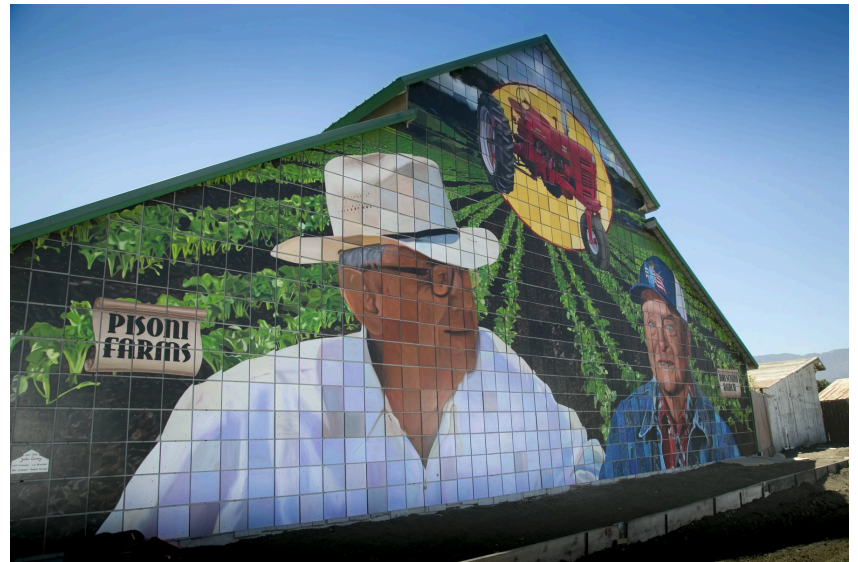
Pisoni Farms mural representing the two owners.