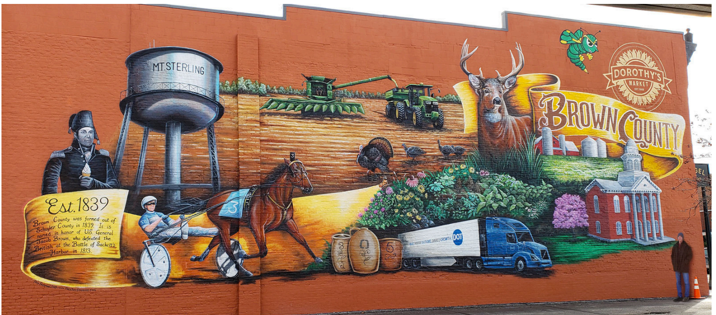
Brown County timeline mural showing the county's history.