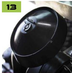
Donaldson® Air Cleaner