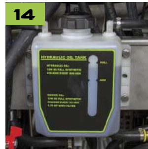
3 QT Oil Reservoir