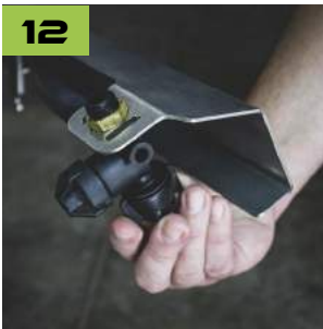
Easy Access Nozzles