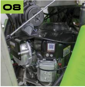
21 HP Engine