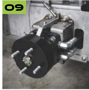
Drum Parking Brakes